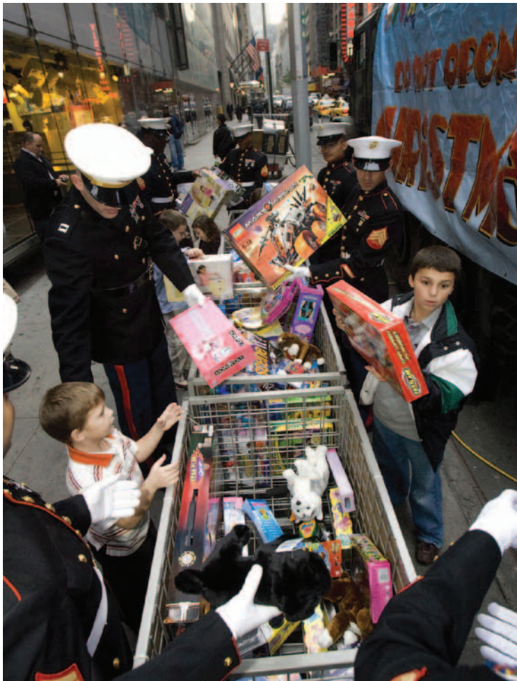
Toys for Tots Holiday toy drive.

newscast's award winning photographers, video producers, designers, Web developers, editors, and experienced communications professionals possess top-level, national and international press experience. Our resources, combined with global capabilities to produce and distribute content are what attract professional communicators to partner with newscast .