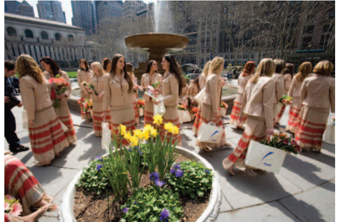
Sears Holding Company Spring Swarm.

newscast's design team can ensure that your branding is captivating and consistent. From graphic design to Flash animation, from brochures to blogs, newscast can refresh and energize you image, create something new or standardize your brand across different marketing platforms.