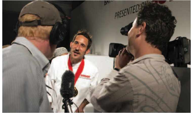
SoyJoy Battle of the Chefs; eco-cuisine.